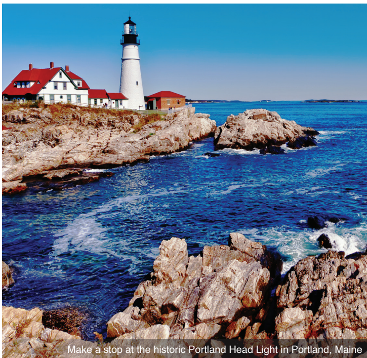
Make a stop at the historic Portland Head Light in Portland, Maine