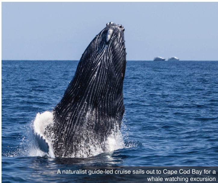
A naturalist guide-led cruise sails out to Cape Cod Bay for a whale watching excursion

DAY 9 Travel Home: This morning, take the group transfer to Boston's Logan Airport for flights out after 12:00 p.m. Meal: B